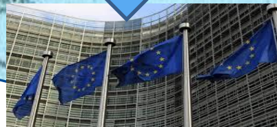
EGE – European Group on Ethics European Commission