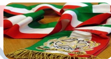
Authorities and Institutions