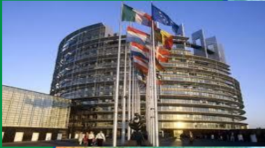
Council of Europe DH-BIO