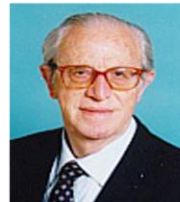
Adriano Ossicini 1992-1994 Medical doctor, professor