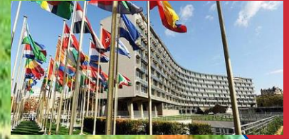
International Bioethics Committee of UNESCO, Paris